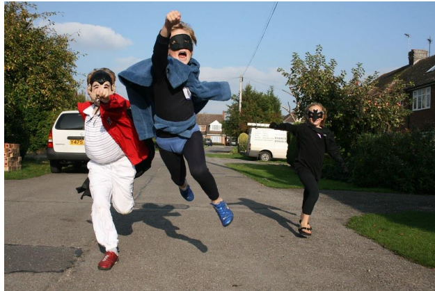
4 - This Girl Can and Now This Boy Can....