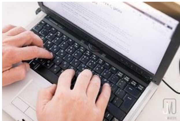
3 - Touch Typing

click Handwriting A big thank you to Mrs Smallwood for leading these sessions with care and consistency.